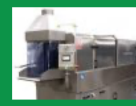
New and Refurbished Food Processing and Packaging Equipment to the African... September 16, 2020