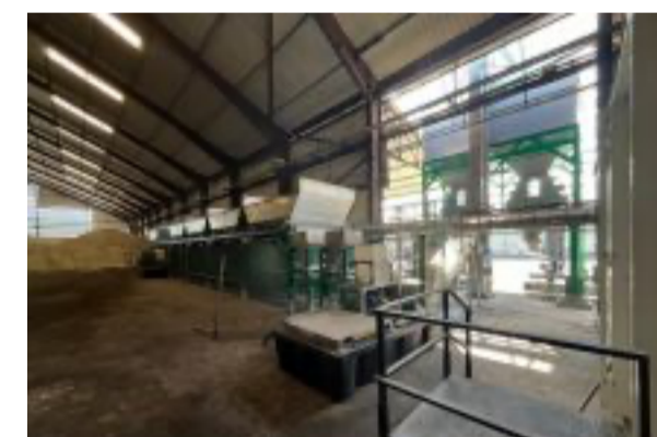
Advancements in Fertilizer Blending and Bagging Systems