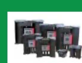
Oil water separators' for agriculture applications October 13, 2020