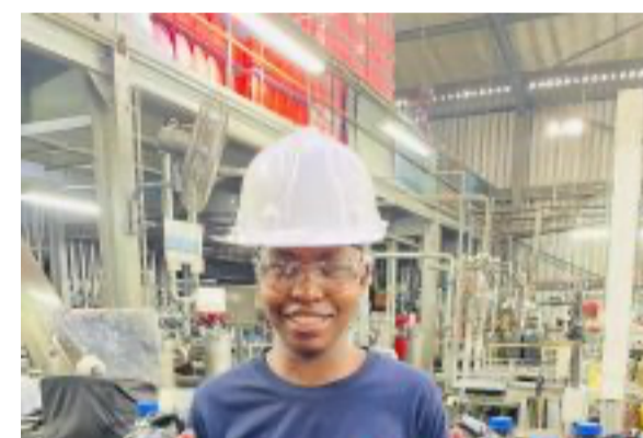
New branding for Mobil Delvac™ from African Group Lubricants