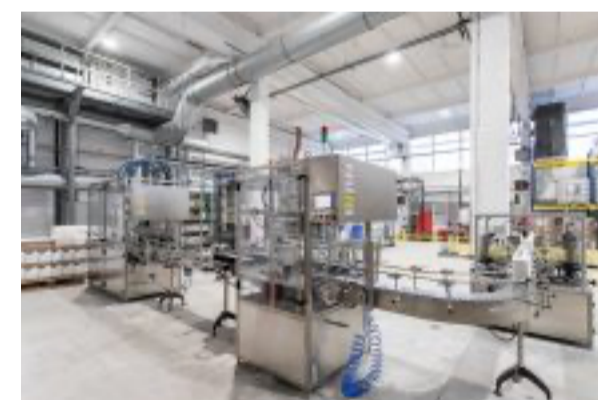
"Nando" is a biotechnology company that develops and manufactures high-added-value microbiological products and chemical additives for agriculture and industry.