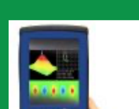
How to Teesh the Right Handheld Eddy Current Tool May 31, 2019