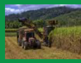
SUGAR CANE PRODUCTION IN ZAMBIA July 24, 2020